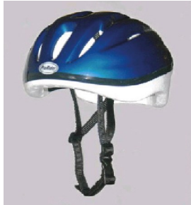
New 8 Vent XS