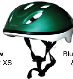
Blue Green & Red