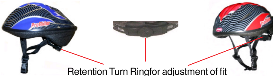
Retention Turn Ring for adjustment of fit

Please circle the size and color of each case Each case contains 32 units