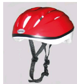
New 8 Vent XS